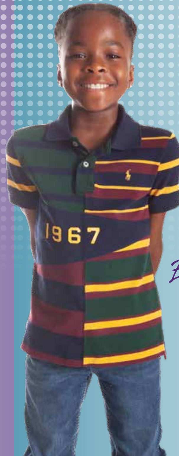
Fon Little Brother Age 11