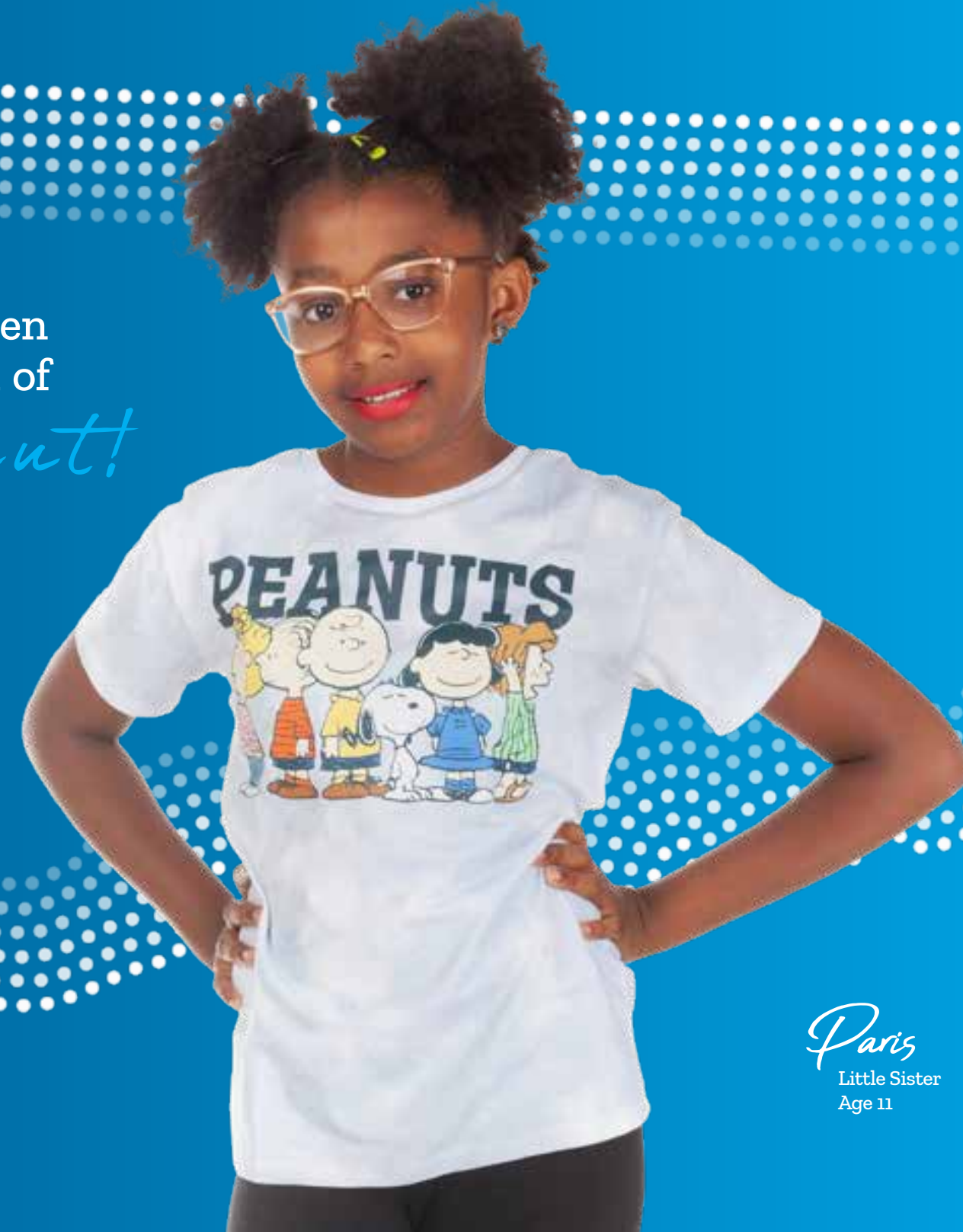
Paris Little Sister Age 11