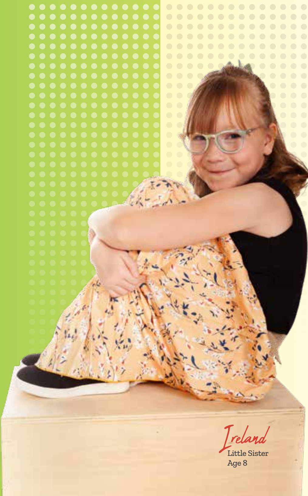
Ireland Little Sister Age 8