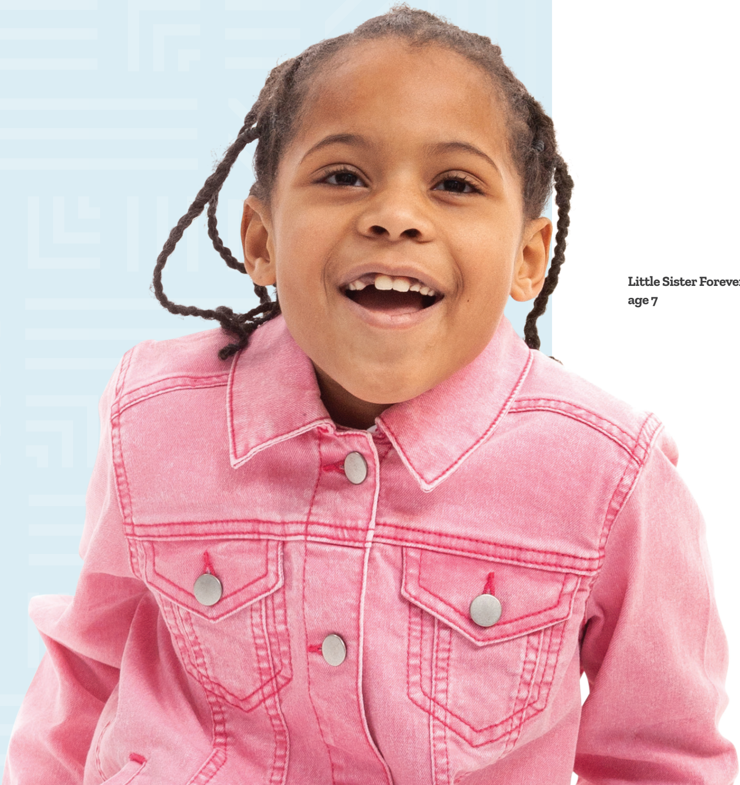
Little Sister Forever age 7